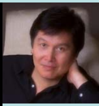
Cheng-Zong Yin 殷承宗 Former faculty and artist-in-residence of Cleveland Institute of Music